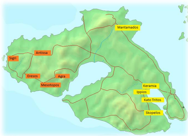
Map 2: Villages surveyed for this paper. In orange background are the 'would-be-affected' villages of western Lesvos; in yellow background are the 'not-to-be-affected' villages of eastern Lesvos.

In Autumn 2012 we visited a number of villages on western Lesvos (which are situated within the development's range thus will be affected by it) and on eastern Lesvos (which will have no direct effect (i.e. visual, noise, etc.) by the 'Aegean Link' project) (see Map 2), and conducted face-to-face interviews with local inhabitants. The sampling technique selected was simple random sampling while, based on the population of the areas' surrounding villages and for a predetermined margin of error ( e=5\% ), the required sample size was 267 (see Table 2 for the samples' details). We tried to survey villages of similar sizes between the two areas, and the number of questionnaires distributed and collected per village/area is shown in Table 1). In the following analyses and discussions we refer to and use the aggregate data.